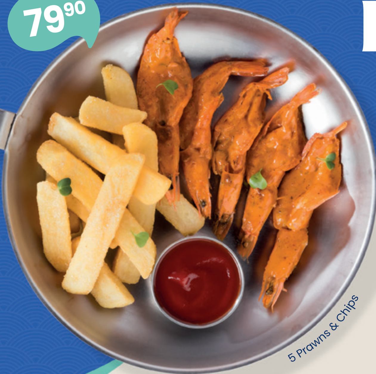
5 Prawns & Chips