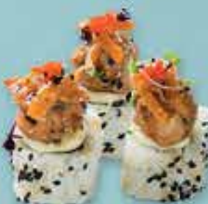
HOT TUNA & HONEY AVALANCHE R66 3 California rolls topped with saffron chutney & coriander infused panko-crumbed tuna balls. Topped with spicy alchar & our signature spicy honey sauce.