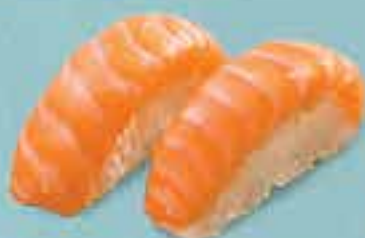
NIGIRI R63 2 Pieces of salmon nigiri.