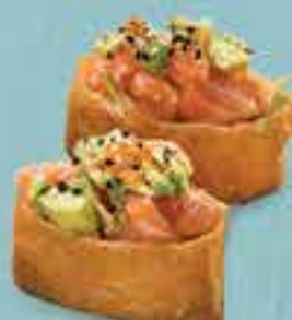
BEAN CURD R66 2 Pockets made from Inari (fried soya beans) filled with rice, avo, Kewpie mayo, Seven Spice & your favourite filling. SALMON/PRAWN