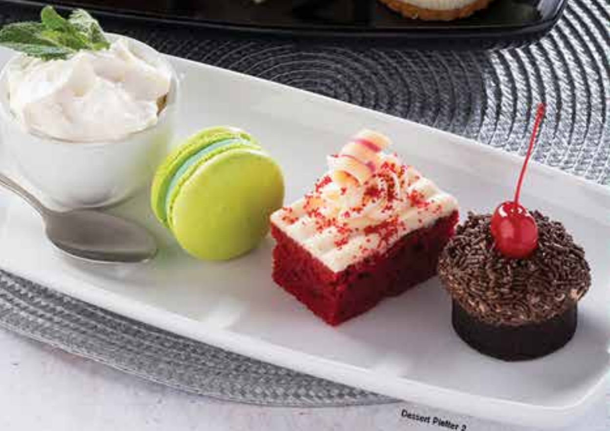
Dessert Platter 2