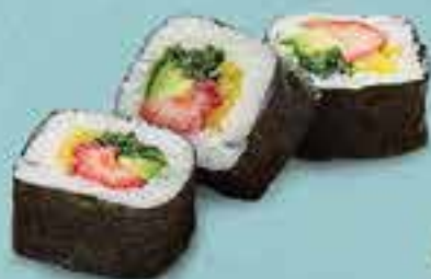
VEG FUTOMAKI ✓ R48 3 Futomaki rolls filled with strawberry, pickled redfish, cucumber & avo.