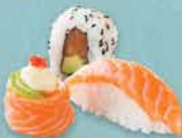
TRIO R63 1 Salmon California roll, 1 salmon rose & 1 salmon nigiri.