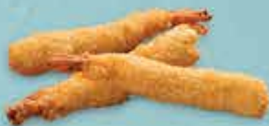
PRAWN TEMPURA R68 3 Prawns dipped in tempura batter & delicately deep-fried. Served with sweet chilli sauce.