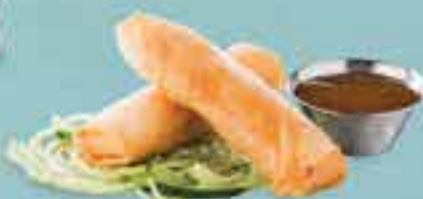
SPRING ROLLS R58 2 Prawn or 2 veg spring rolls. Served with sweet chilli sauce.