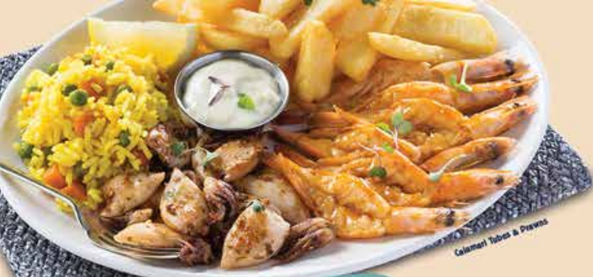
Calamari Tubes & Prawns