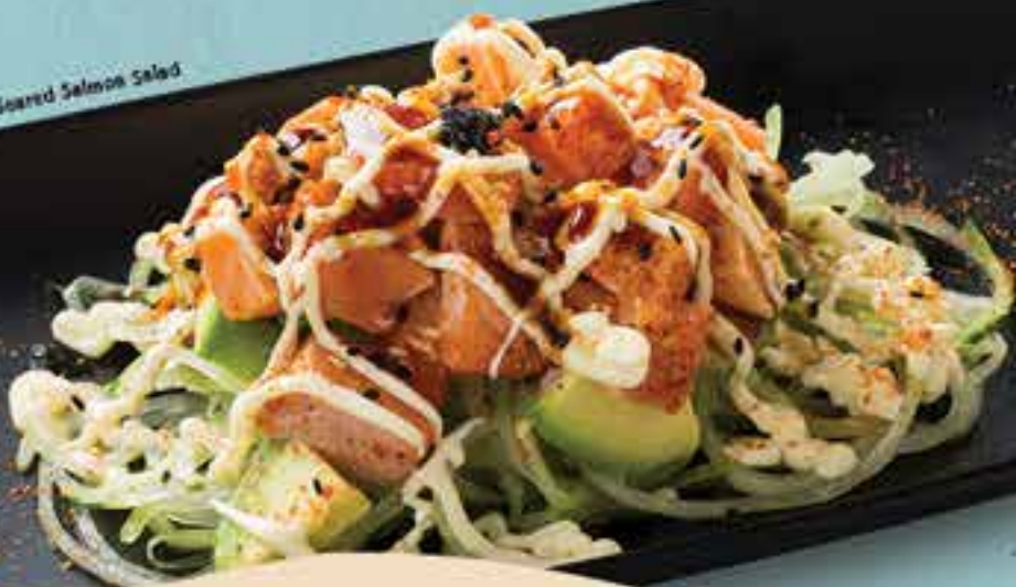
Seared Salmon Salad