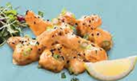
POPCORN PRAWNS R58 6 Popcorn prawns, tossed in a bang bang sauce & sprinkled with spring onion & sesame seeds.