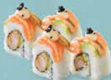
TEMPURA RAINBOW ROLLS R66 4 Tempura prawn California rolls with delicate slivers of salmon & avo. Topped with Sriracha mayo, Kewpie mayo & cavi-arl.